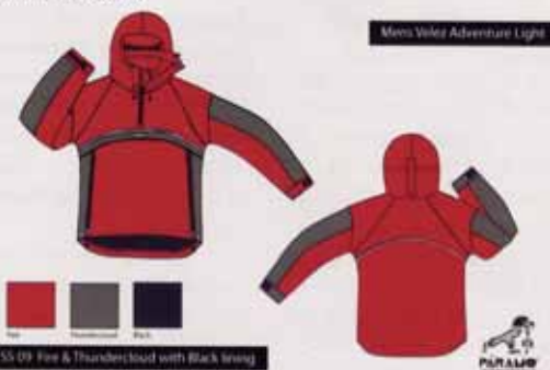
Men's Velez Adventure Light